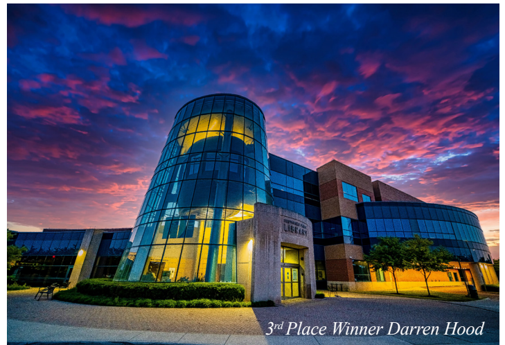
3 rd Place Winner Darren Hood